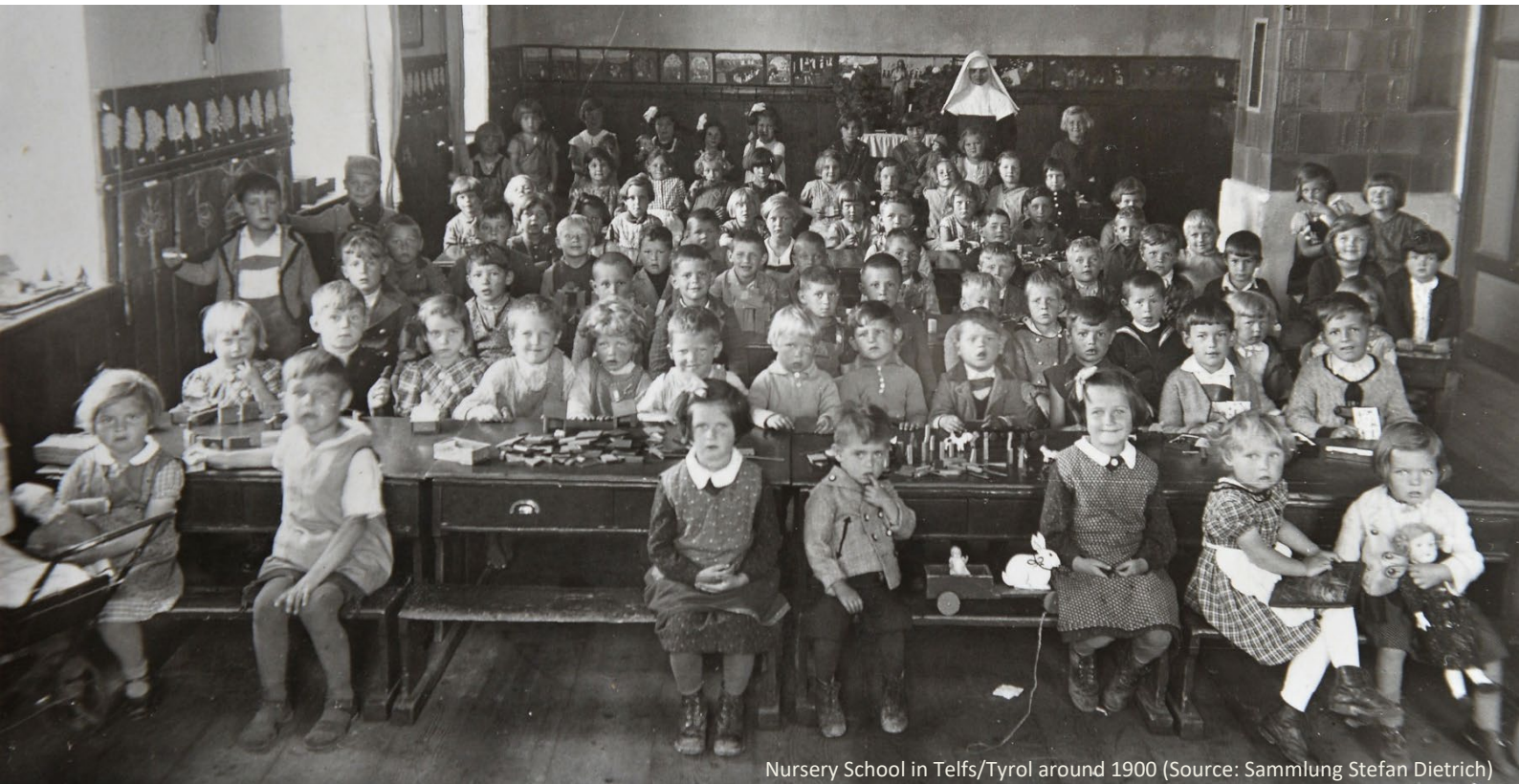
Nursery School in Telfs/Tyrol around 1900

University of Innsbruck (24–25 September 2020)